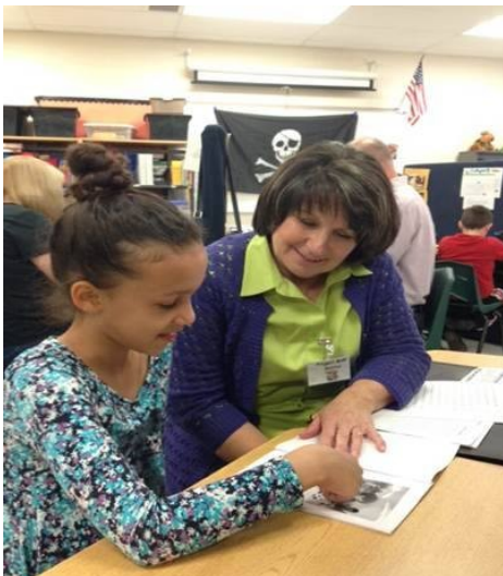
Wheelersburg Local School District Mentor A Pirate (MAP)